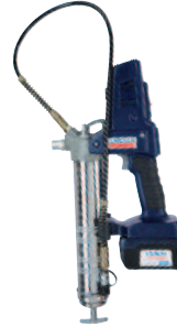
18 V Li Ion PowerLuber Model 1862-E