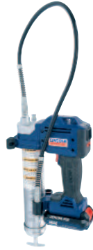
20 V Li Ion PowerLuber Model 1882-E

Lincoln's PowerLuber family includes a full range of battery-operated grease guns, including NiCad and Lithium-Ion-powered tools, as well as pneumatic and electric options. Developed by the lubrication experts, the PowerLuber line has the right grease gun for your needs.