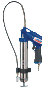
Pneumatic PowerLuber Model 1162