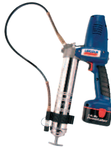
14 V PowerLuber Model 1442-E