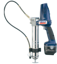
18 V NiCad PowerLuber Model 1842-E